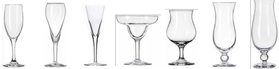
Champagne Margarita Daiquiri Hurricanes Fluted Tulip V-Shaped 6.0 oz 6.0 oz 5.5 oz 9.2 oz 13.75 oz 15.0 oz 23.0 oz

NOTE; Illustrations may not always be to correct proportions, especially in relation to the other glasses. For best results, please come by TRC before making your selection! All glasses come racked, sealed and ready-to-use.